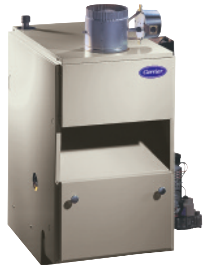
Models BW1 & BW2