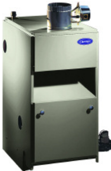
Models BS1 & BS2